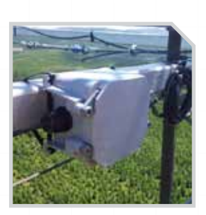
Contractor: Electro Kingsey Products Used: 10 JBX666

The new Kraloy JBox is very easy to open and handle. Installation was fast and easy. There's no other box like it!