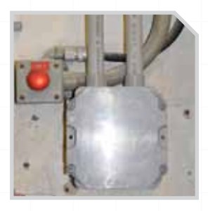
Contractor: AG Electric Ltd. Products Used: 50+ JBX664