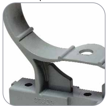
Friction reduction ribs to permit conduit expansion/contraction